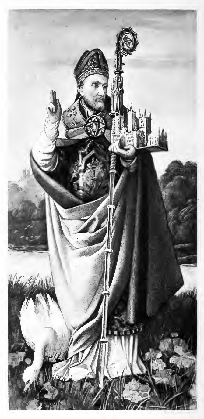
Hugh of Lincoln.